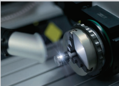
Lettering with laser technology

With technical ceramic parts, when the requested component quality has already been achieved, appearance applications often require extensive and demanding surface finishing. By using processing techniques such as tumbling (grinding and polishing) or specific component processing, OECHSLER is able to provide design parts featuring not only an extremely high degree of gloss but also a fascinating impression of depth.