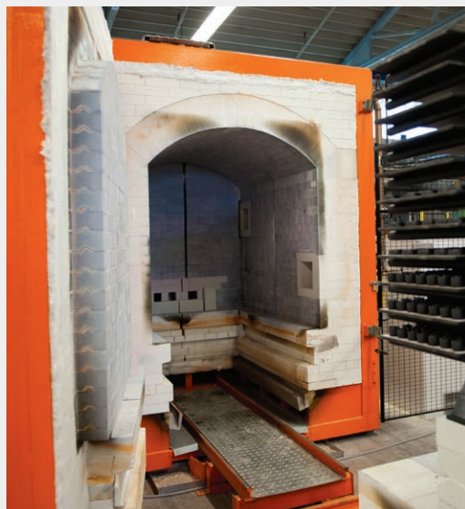
De-binding and sintering in the ceramic furnace

Finally, by using various special techniques, it is possible to partially matt or coat the components (ESD protection, for example), or to apply lettering.