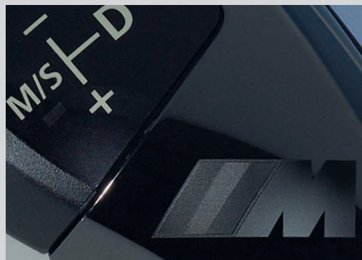
Enhancement through finishing

On this „perfect“ surface, further styling is now also possible by other processes such as printing, adhesion, painting, lettering, or coating. In this way, design parts